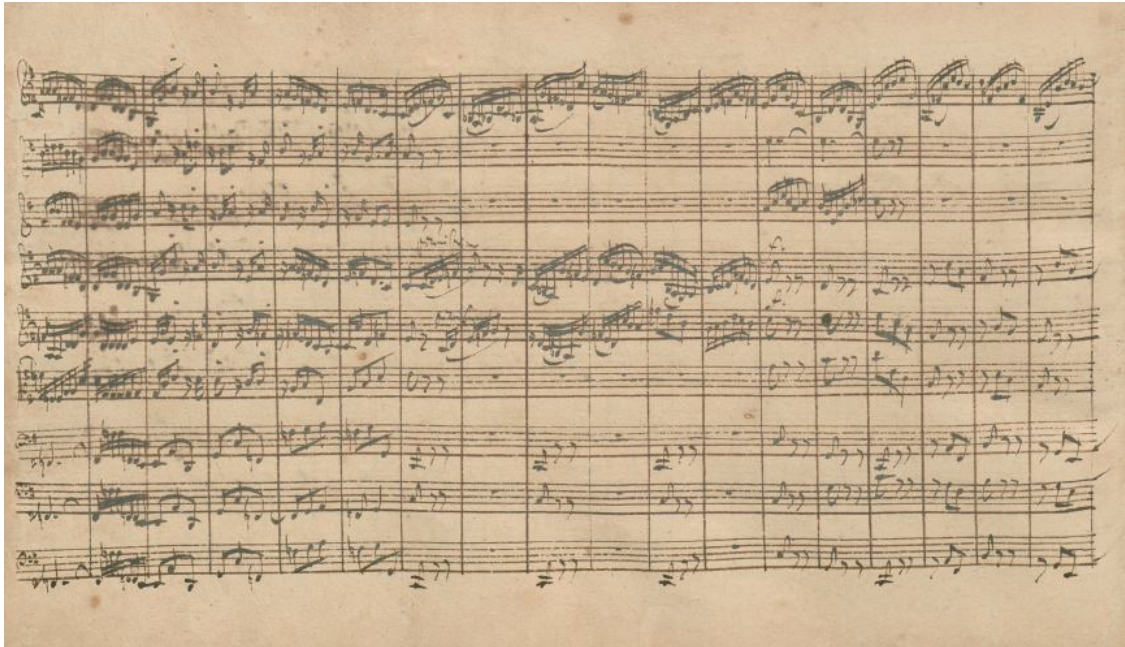
Figure 39 Episode 3 Bach manuscript