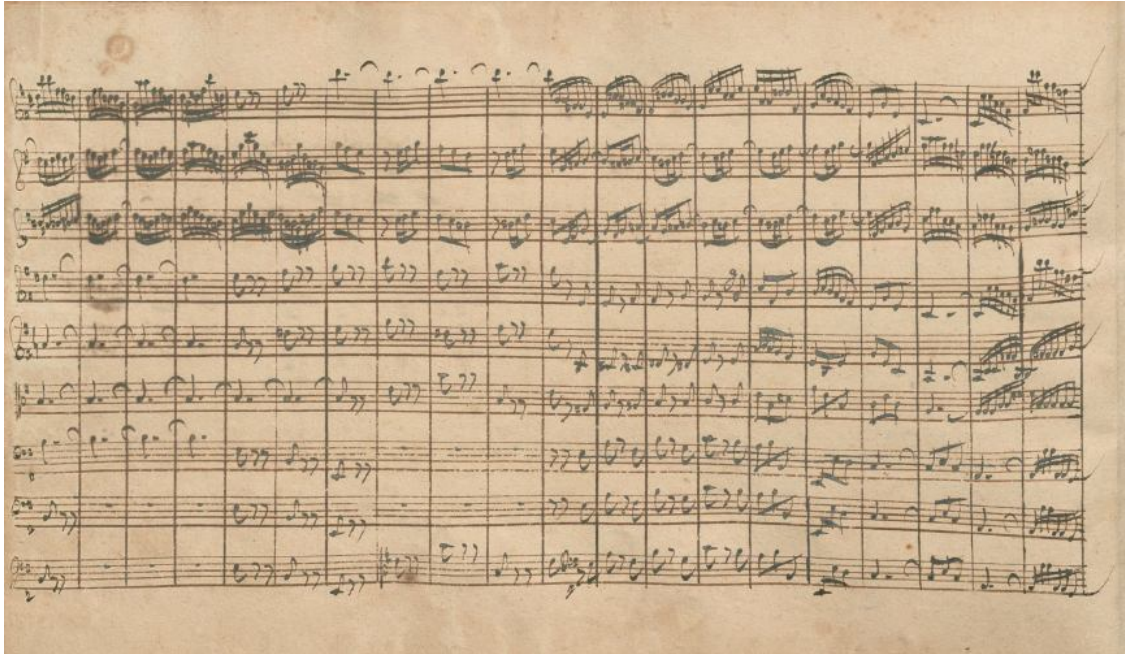
Figure 31 Ritornello 2 Bach manuscript