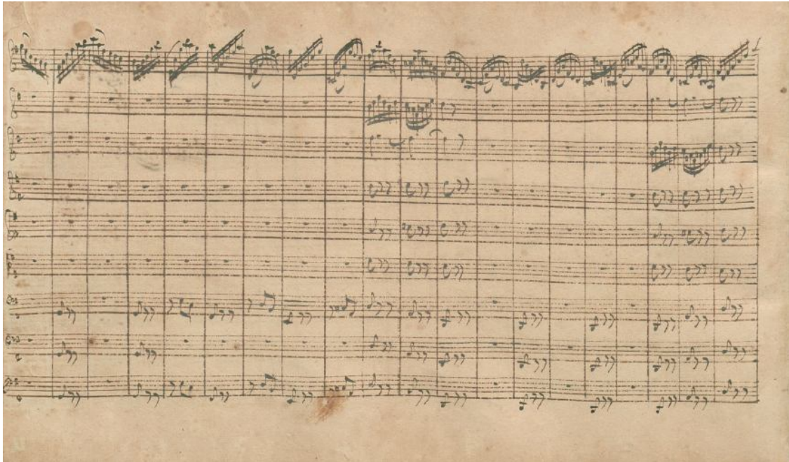
Figure 27 Episode 1 Bach manuscript