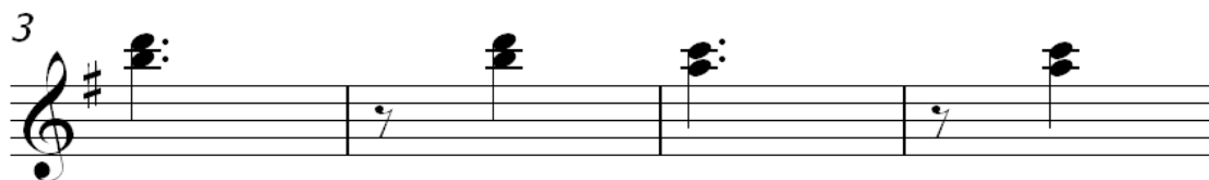
Figure 7 Ritornello Motif bar 3 to 6 in reduction