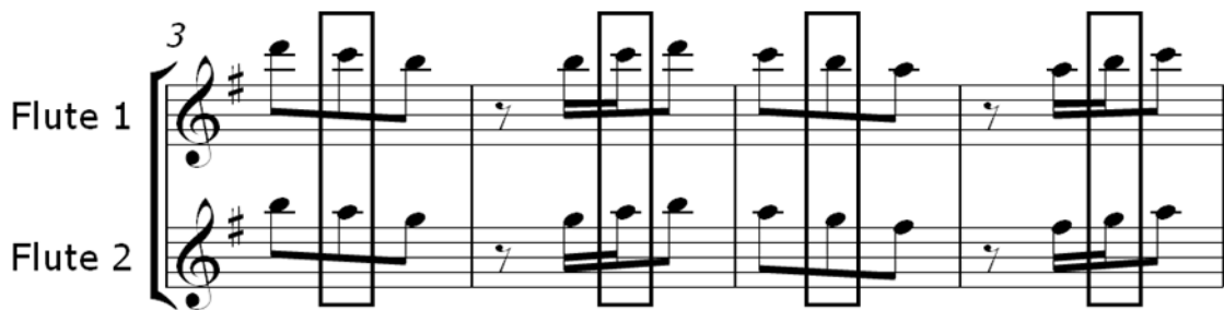
Figure 6 Ritornello Motif bar 3 to 6, flutes