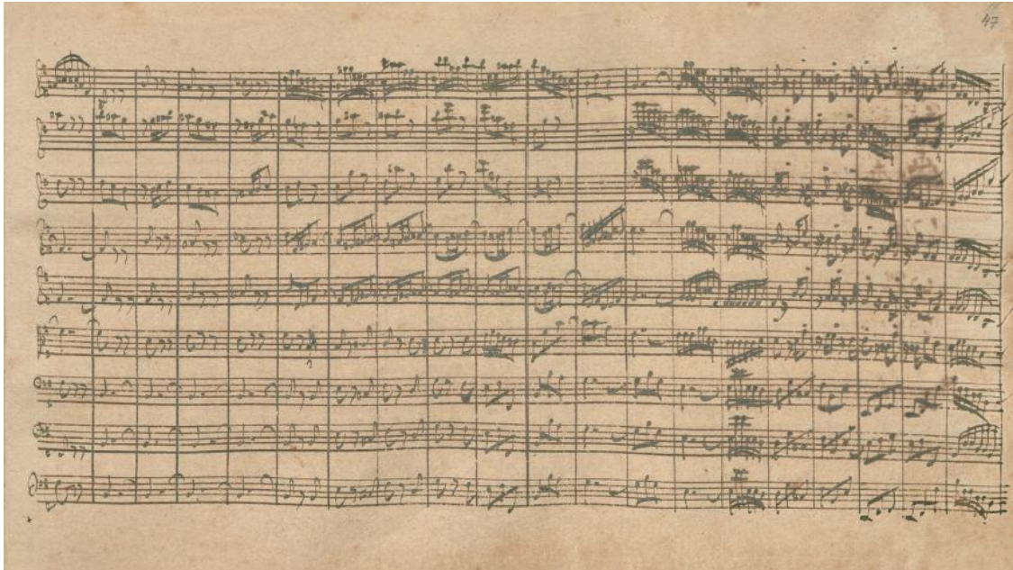
Figure 42 Ritornello 4 Bach manuscript