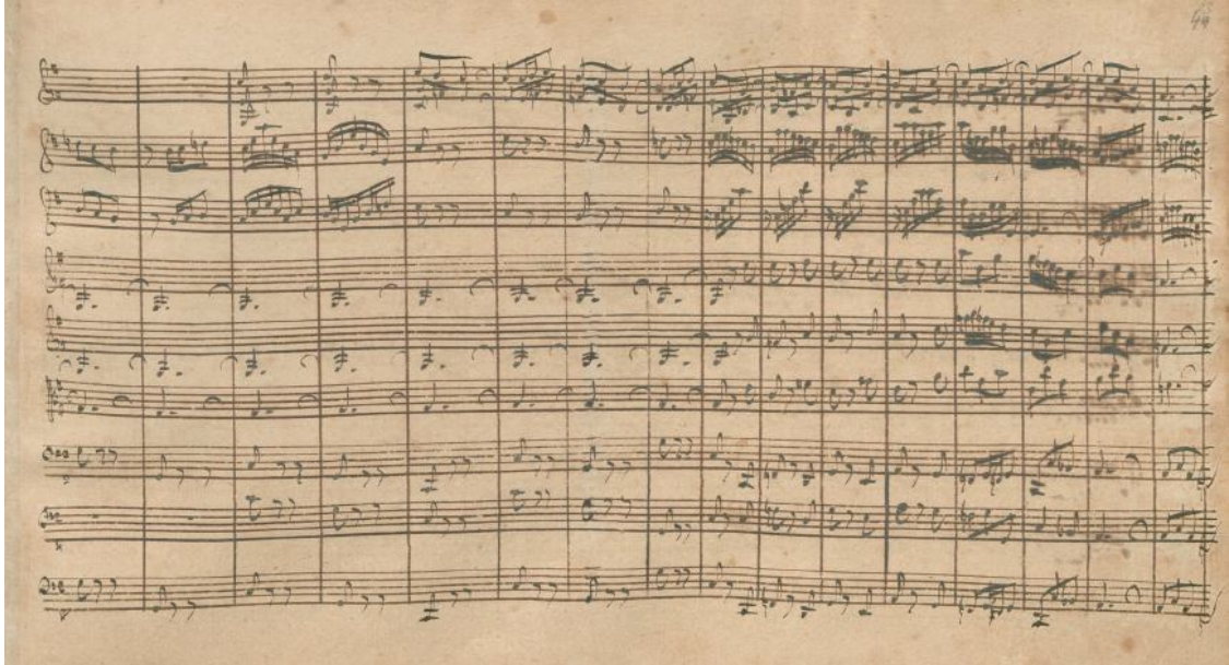
Figure 37 Ritornello 3 Bach manuscript