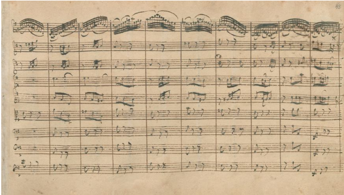
Figure 35 Episode 2 Bach manuscript