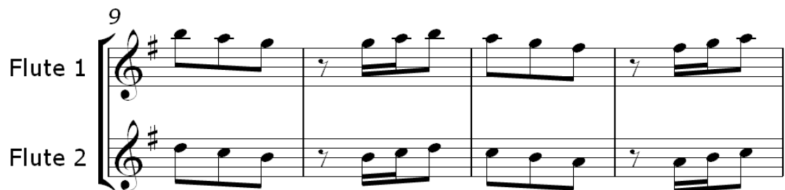
Figure 8 Ritornello Motif bar 9 to 12, flutes